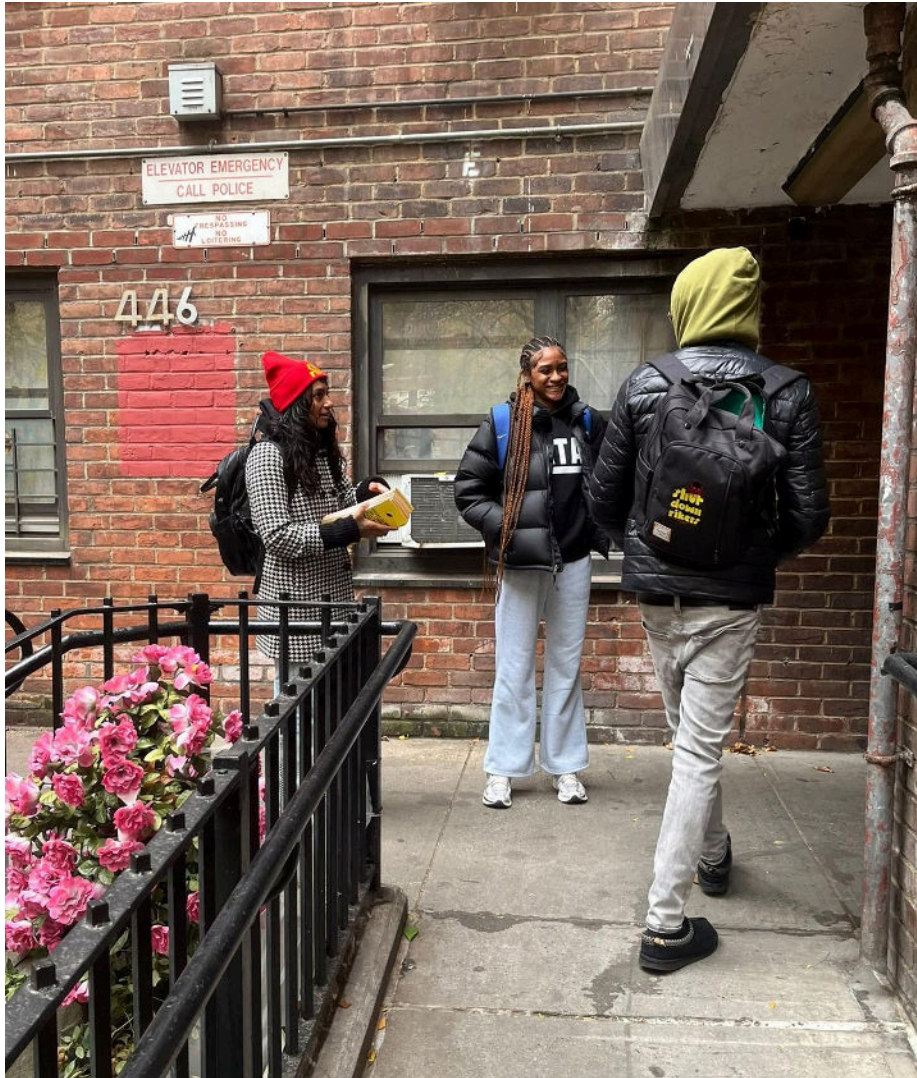
Katal outreach team at the NYCHA's Chelsea Houses, 11.14.24

Over the last two weeks, the Katal team connected with community members across Manhattan, Queens, and Staten Island about our campaign to #ShutRikers . Last Thursday, we visited the Chelsea NYCHA Houses and spoke to neighborhood residents about the changes they want to see within their community. People were upset that the city is spending over $500,000 per year per person to incarcerate someone at Rikers. At the same time, public housing, including NYCHA, continues to be woefully underfunded by the city.